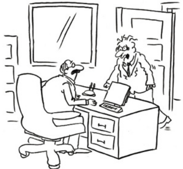
“I had a layover in Omaha ... which led to a hangover in Des Moines.”