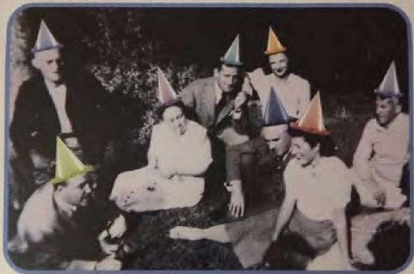
A group of A.A. people in California (possibly Long Beach) in the 1940's: Bill W. is on the right, Dr. Bob is on the left, and Anne Smith (with cigarette) is in the center.